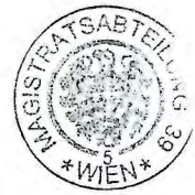
Table 4: Summarised results (MA 39 – VFA 2017-0453.01)